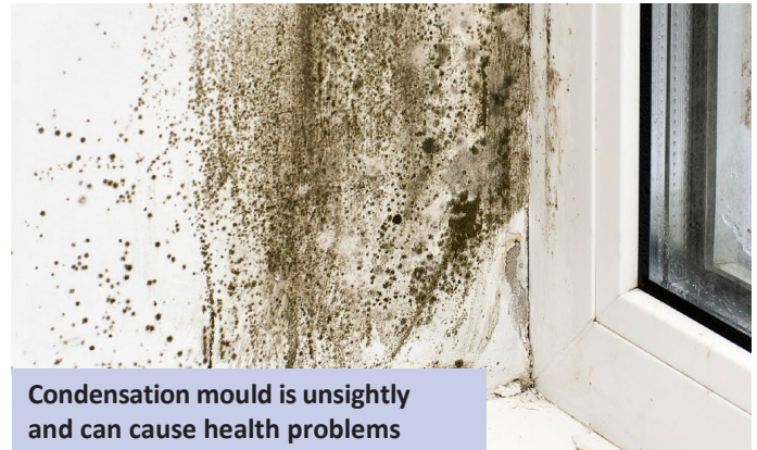
Condensation mould is unsightly and can cause health problems

Newly built homes can sometimes feel damp because the water used during construction (in cement, plaster etc) is still drying out.