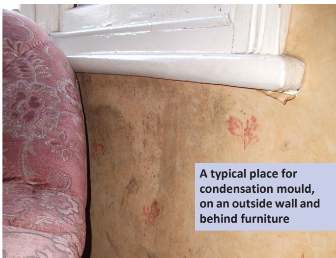
A typical place for condensation mould, on an outside wall and behind furniture